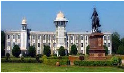
Shivaji University, Kolhapur.

Venue: MKSSS's Cummins College of Engineering for Women, Pune