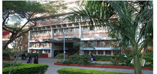
MKSSS's Cummins College of Engineering for Women, Pune

Jointly Organized by Shivaji University, Kolhapur And MKSSS's Cummins College of Engineering for Women, Pune