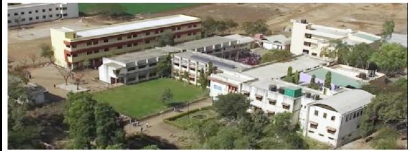
N.V.P. Mandal's Arts, Commerce and Science College, Lasalgaon (Nashik)