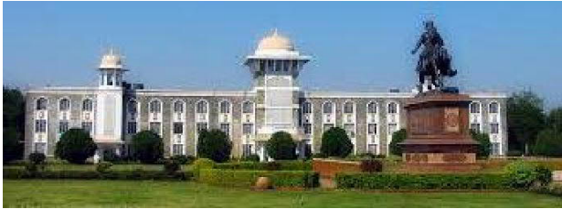
Shivaji University, Kolhapur.

Venue: N.V.P.Mandal's Arts, Commerce and Science College, Lasalgaon (Nashik)