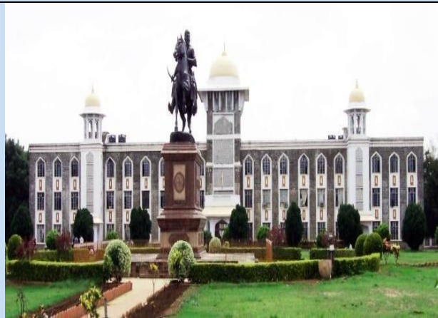
Shivaji University, Kolhapur

Venue: Rajarshi Shahu Mahavidyalaya (Autonomous), Latur