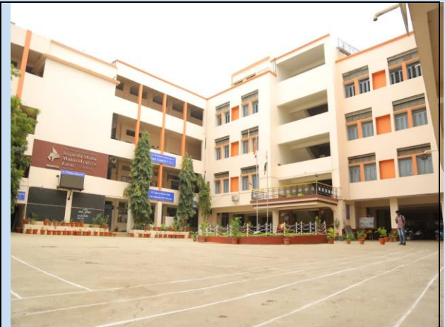
Rajarshi Shahu Mahavidyalaya (Autonomous), Latur

Jointly Organized by Shivaji University, Kolhapur and Department of Computer Science, Rajarshi Shahu Mahavidyalaya (Autonomous), Latur